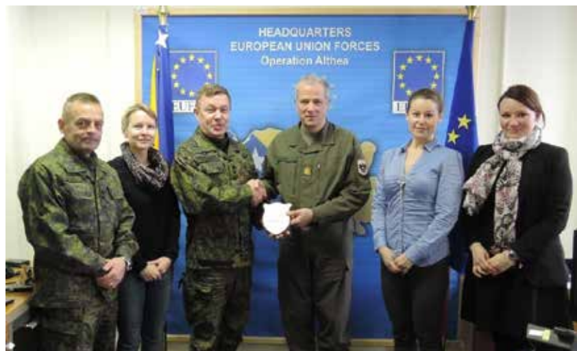
IECEU visiting the HQ Althea