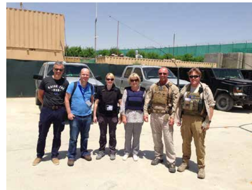
Members of the IECEU project on a field visit to Afghanistan

hundreds of armed militias in Libya were “largely out of control” 25 . When an invitation finally arrived, from the government of Prime Minister Zidan, the EU rushed to launch the mission, and therefore did not follow the normal procedure for constructing an Operation Plan 26 (OPLAN). 27 CSDP border related missions as standard require comprehensive assessment, such as evaluation of the country's present border capability, management needs, security, social, and political risks and vulnerabilities. This assessment is required to take place before a mission is established. 28 The quick mission launch, and lack of a proper situational assessment, was problematic as some of the political aspects, like the situation in Libyan politics, had changed since the original plan, and was not properly considered. 29 Another essential element blocking mission planning, was that in ultimo 2012, the south of Libya was declared a military zone, which meant the area was off limits for any international mission. This, according to Libyan interviewees, made the whole matter of border control insignificant. 30